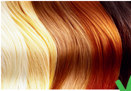
Natural hair colours